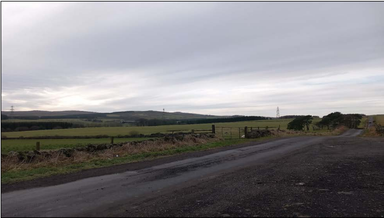
View of the site from Auchentiber Road looking west

The site is more open to view from the east when travelling along Auchentiber Road particularly at the bend in the road at Loganwood House as the views are across open fields with no topographical screening or woodland screening. The existing electricity pylons are in the background when the site is viewed from this direction. Further in the distance are the wind turbines at the Inverclyde Windfarm at Corlic Hill. The pylons and turbines break the skyline when viewed from this direction.