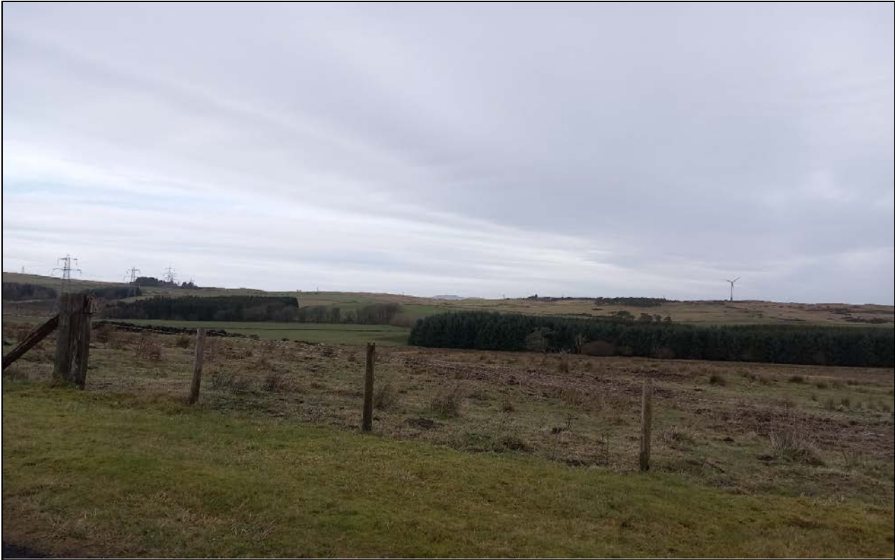
View looking north from the access road to The Haven

The proposed development does not break skylines and is far enough away from the Muirshiel Regional Park to not have a significant visual impact on the Park.